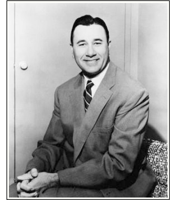
GRANVILLE ORAL ROBERTS 'FAITH HEALER'

Granville Oral Roberts was born January 24, 1918 in Pontotoc County, near Ada, in Oklahoma, to deeply religious parents. His father was a farmer who also preached the gospel and established Pentecostal Holiness churches. His mother regularly prayed for the sick and led people to Christ. While she was still pregnant, Robert's mother, committed Oral to God's service. Even though Oral had a very strong stutter his mother would tell him that one day God would heal his tongue and he would speak to multitudes.